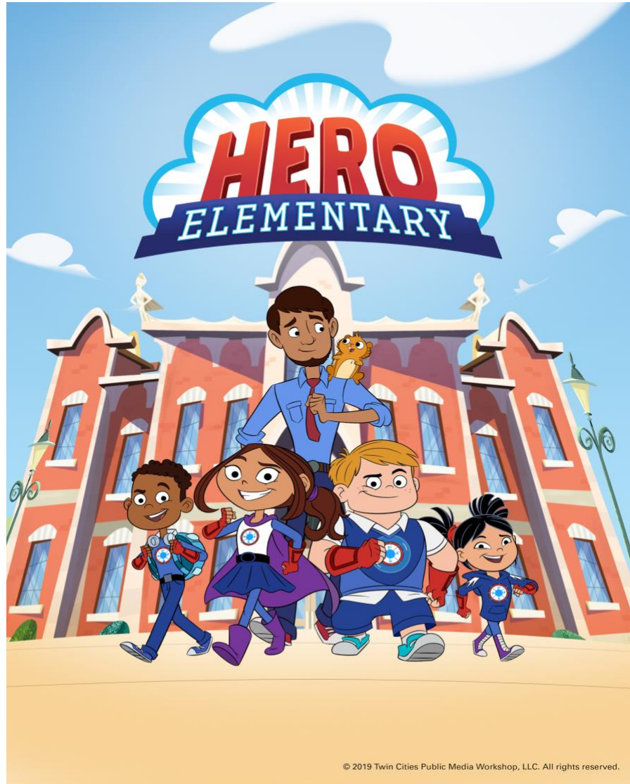
Figure 1. Hero Elementary's cast of characters.

For use in informal and formal learning settings, Hero Elementary learning resources are bundled into “playlists,” with each playlist focused on a specific science topic aligned to grade-level standards. Resources in each playlist include a television episode, two hands-on science-focused activities, two tablet-based Science Power Notebook activities, a digital or analog game, and an e-reader activity. Playlists can be implemented by educators in classrooms or virtually. Educators guide students through the digital and non-digital activities in the playlists, all designed to engage students in science exploration and learning. Students access Hero Elementary resources by logging into their Hero Elementary account via a tablet or other digital device. Educators can monitor students’ progress by viewing an educator dashboard. Table 1 shows the contents of a typical playlist — this one is focused on life science and titled Animal Parents and Their Young .