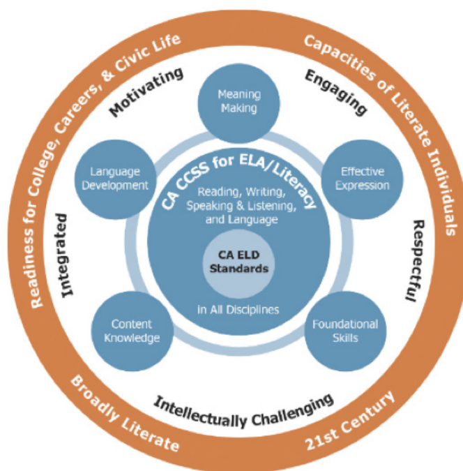
Figure 1. California English Language Arts/English Language Development Framework: Circles of Implementation

the core of teaching and learning for all grade levels: meaning making, effective expression, foundational skills, content knowledge, and language development. These themes act as organizing components for all grade-level teaching and learning, including TK–1, and throughout the ELA/ELD Framework there is a strong emphasis on the integration of these themes in learning tasks. 1 All teaching and learning should be firmly grounded in the standards, and these five themes highlight the interconnections among and between two sets of standards: the CA CCSS for ELA/Literacy and the CA ELD Standards.